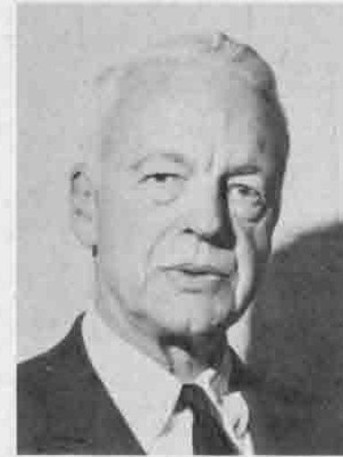
Dr. Robert Hutchins

Increased production has come with shorter numbers of working hours, he said, and consequently, there is more leisure and more time to "develop the highest human ideas."