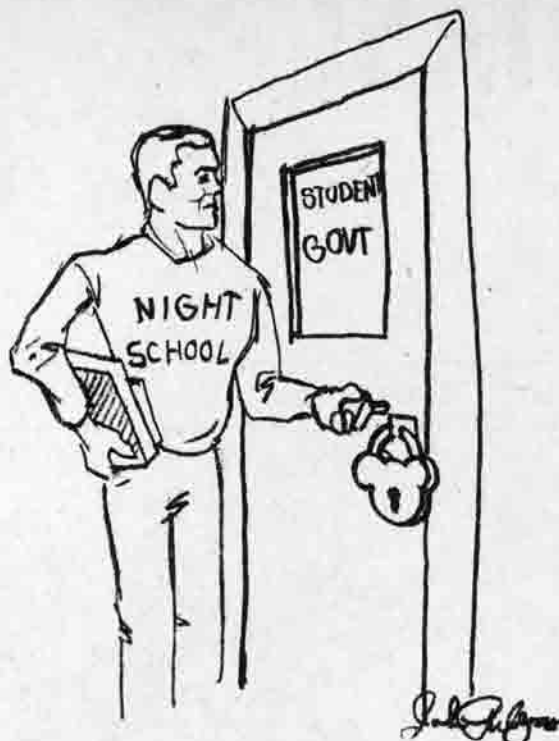
Government Shut Outs